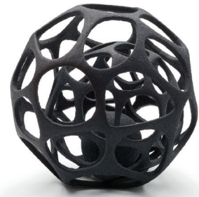
Picture taken after dye post-processing