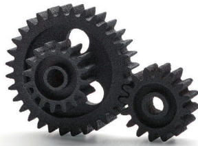
Picture taken after dye post-processing